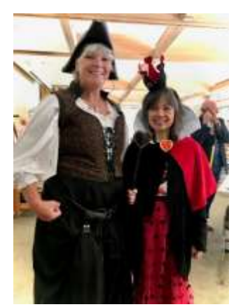
Queen of Hearts & Dread Pirate Wendy