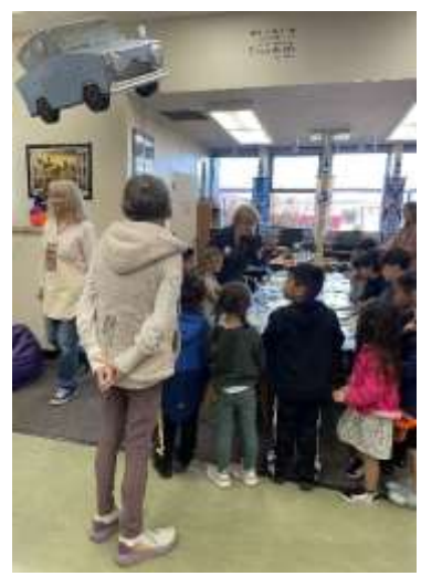
Students Eager to Choose Books