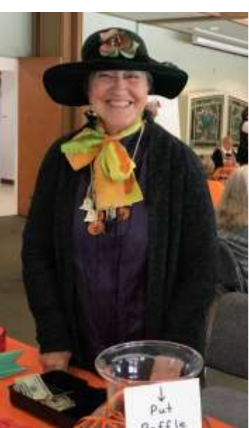
Pat's Smile Sells Tickets