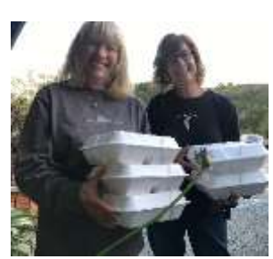
Sharing a Load