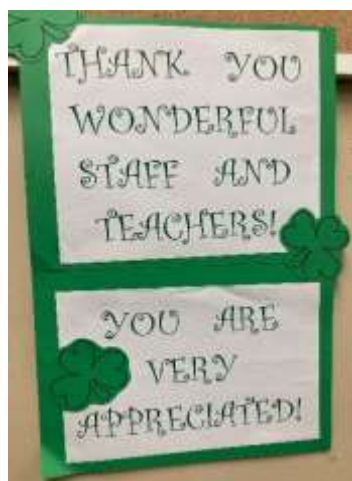
Words of Encouragement for Marina Vista Staff