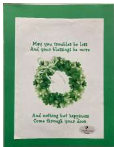
An Irish Blessing for Marina Vista Staff