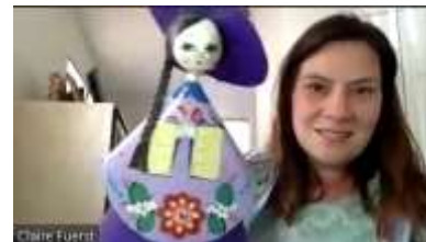
We were all smiles during the orientation!