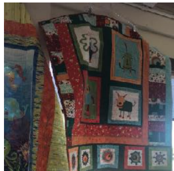
Quilt for auction