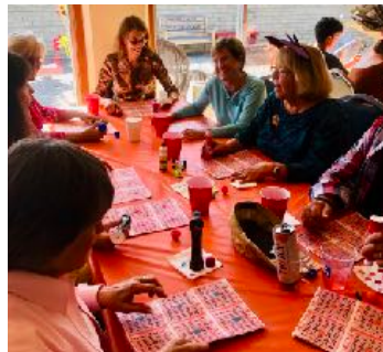
Hoping for your number.