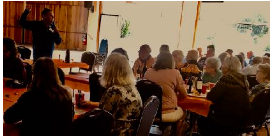
The Bingo Caller