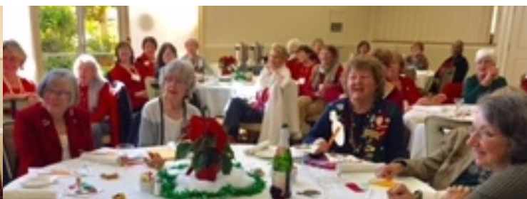
The gathering was held at the Hacienda Carmel Casa Fiesta which provided a great space for the large turnout.