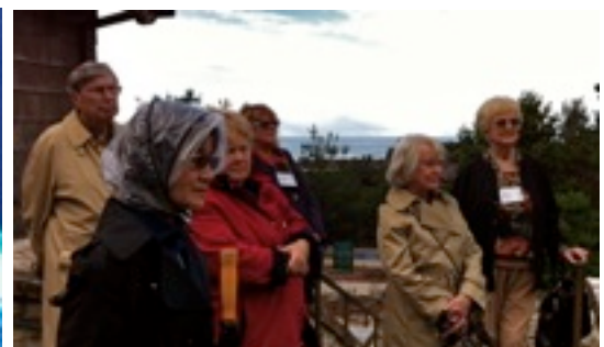
Despite the rain we covered several buildings around the grounds designed by Julia Morgan.