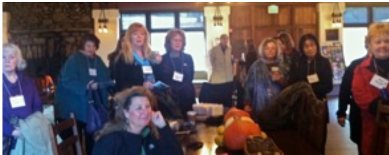
We all enjoyed the warmth and elegance of the Social Hall while enjoying warm drinks from the cafe.