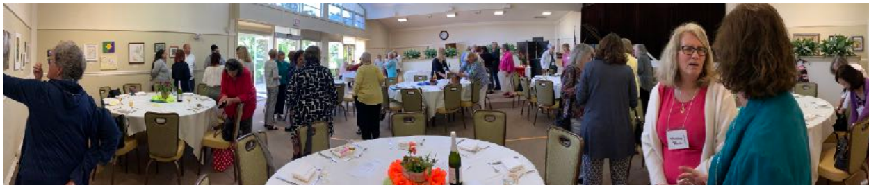
A convivial group assembled in the Hacienda Carmel meeting room for the End of the Year meeting and a delicious quiche lunch.