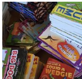
Above: Students choose a book from a large assortment.