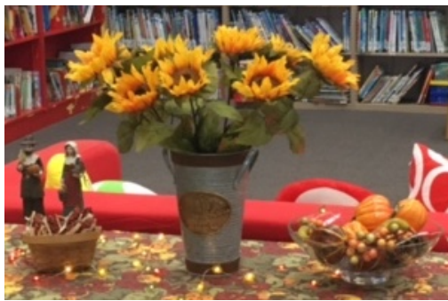
Thanksgiving Decorations for RIF at Crumpton