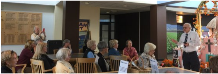
The Docent gave us lots of interesting information before we began our tour of the museum.