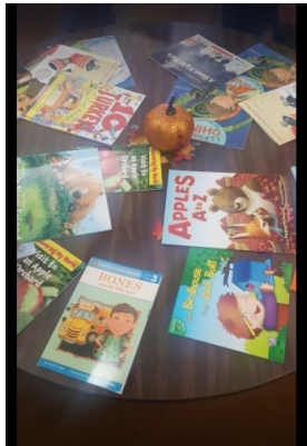
Happy recipients of the RIF book distribution at Crumpton