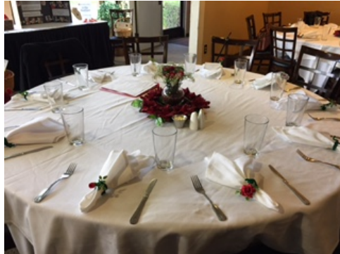
The tables were set with lovely red flowers and napkin rings.