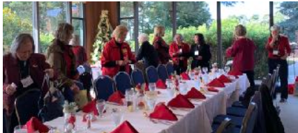
Red and white tables in the Del Mesa dining room welcomes Delta Lambda.