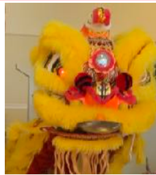
The star of an exciting Lion Dance