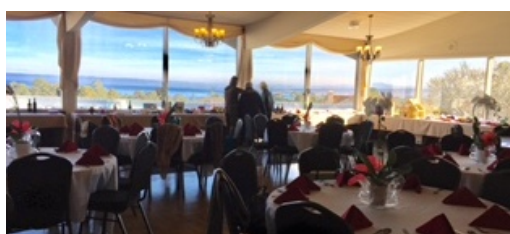
The incredible view