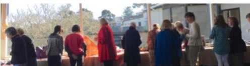
The Silent Auction kept folks busy.