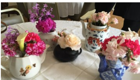
Charming teapots of posies decorated the tables.

Betty's camp in the remote land of the goat and sheep herders.